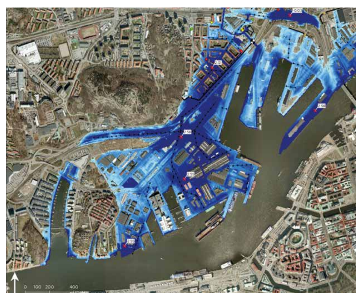
The hydrological model is an excellent tool to simulate the dynamics paths of water when the city is flooded.

The hydrological model is an excellent planning tool, especially when it comes to simulating the dynamic paths of water. The city has been able to see, for example, which low areas might be flooded at high tide from the sea. The reason for this flooding could be, for example, pressure in the underground water pipes. Another result is that the city, with relatively small actions, can protect large areas.