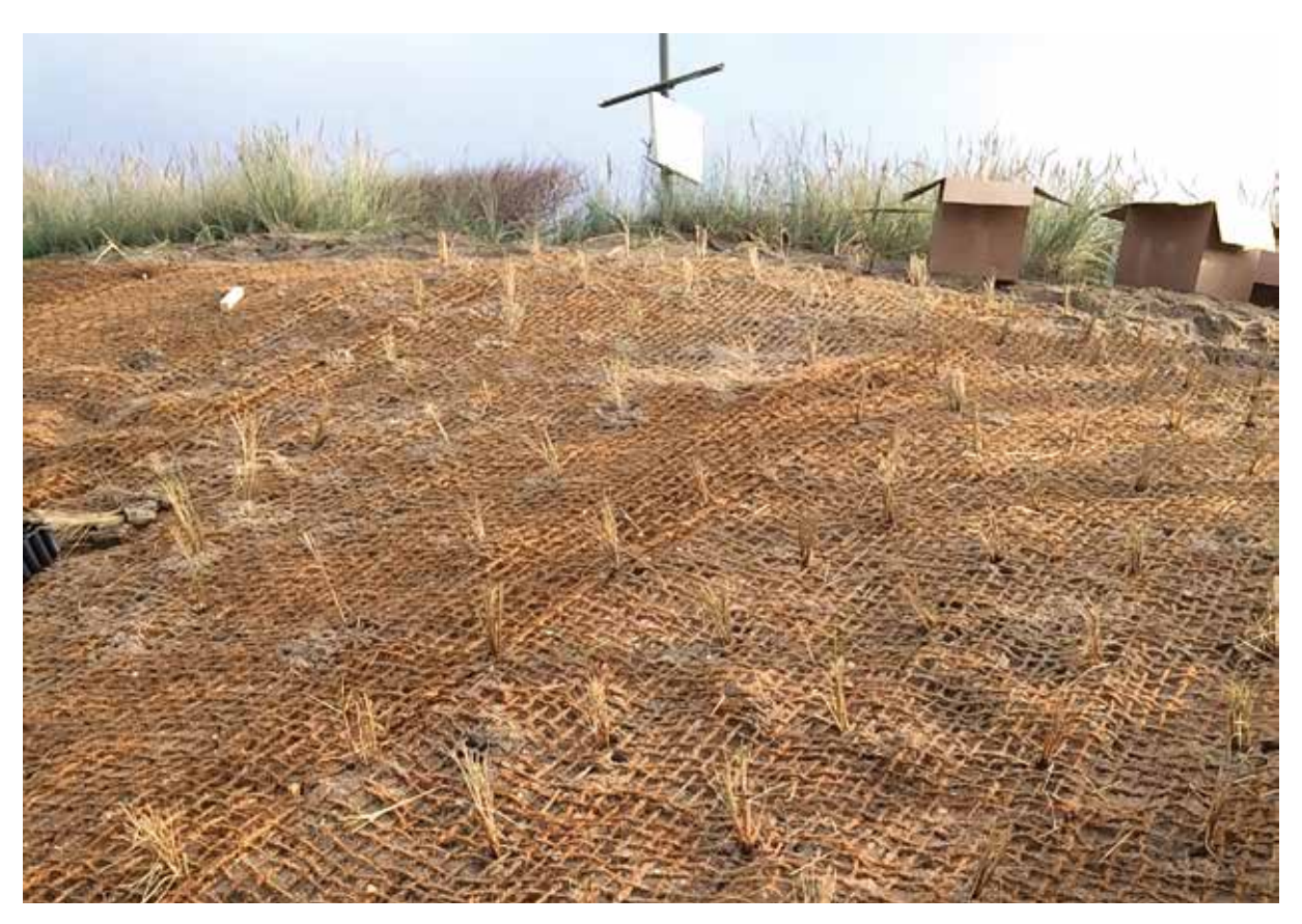
Planting beach grass on the dunes is one example of a disaster risk reduction action.

Work began last year and will continue for several years. Ängelholm does not have enough data to evaluate the measures carried out yet.