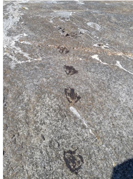
Footprints from a swan observed at Kvernskjær