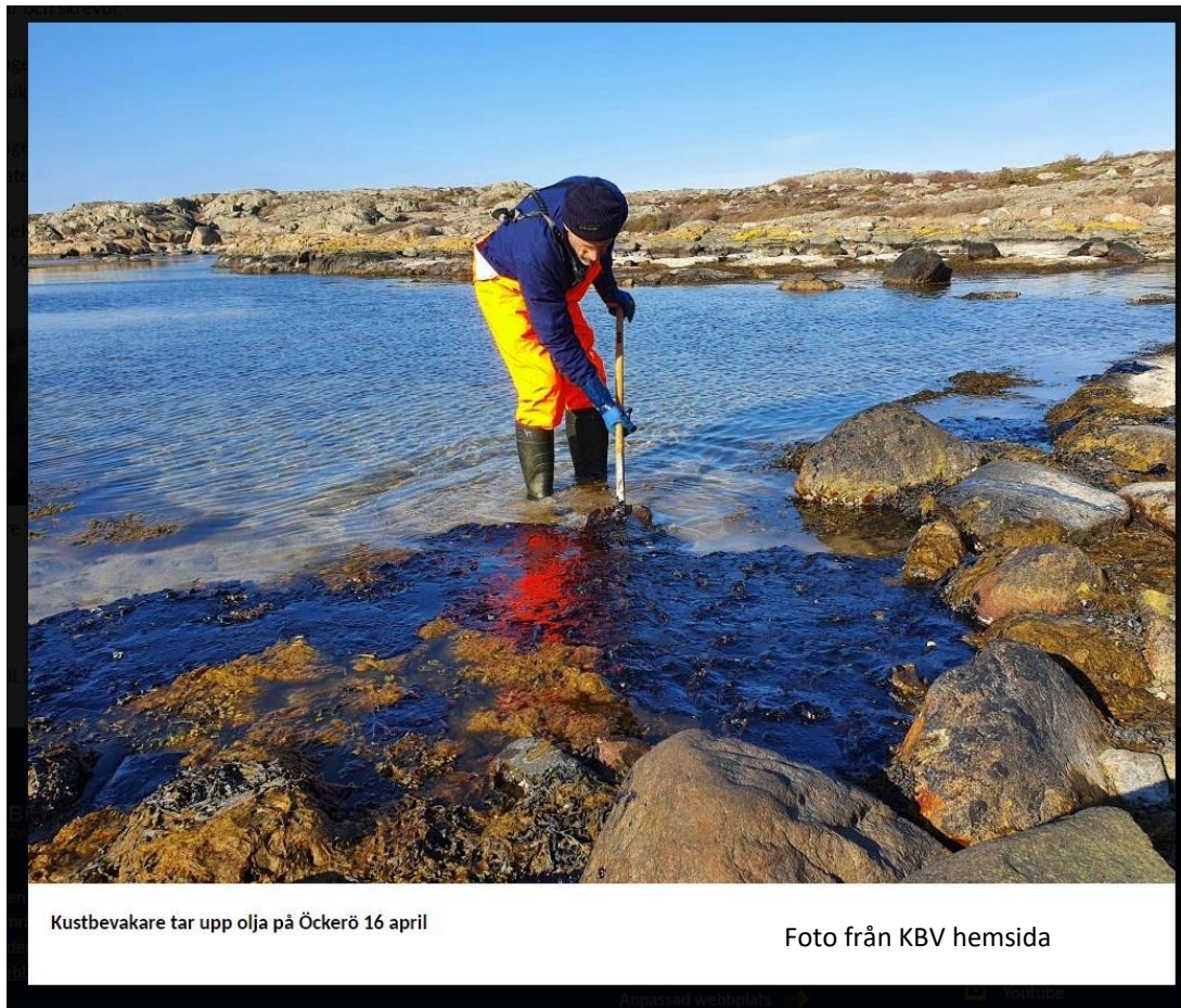
Kustbevakare tar upp olja på Öckerö 16 april