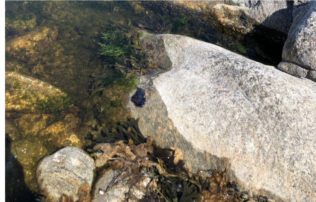
Oil stuck to the bedrock